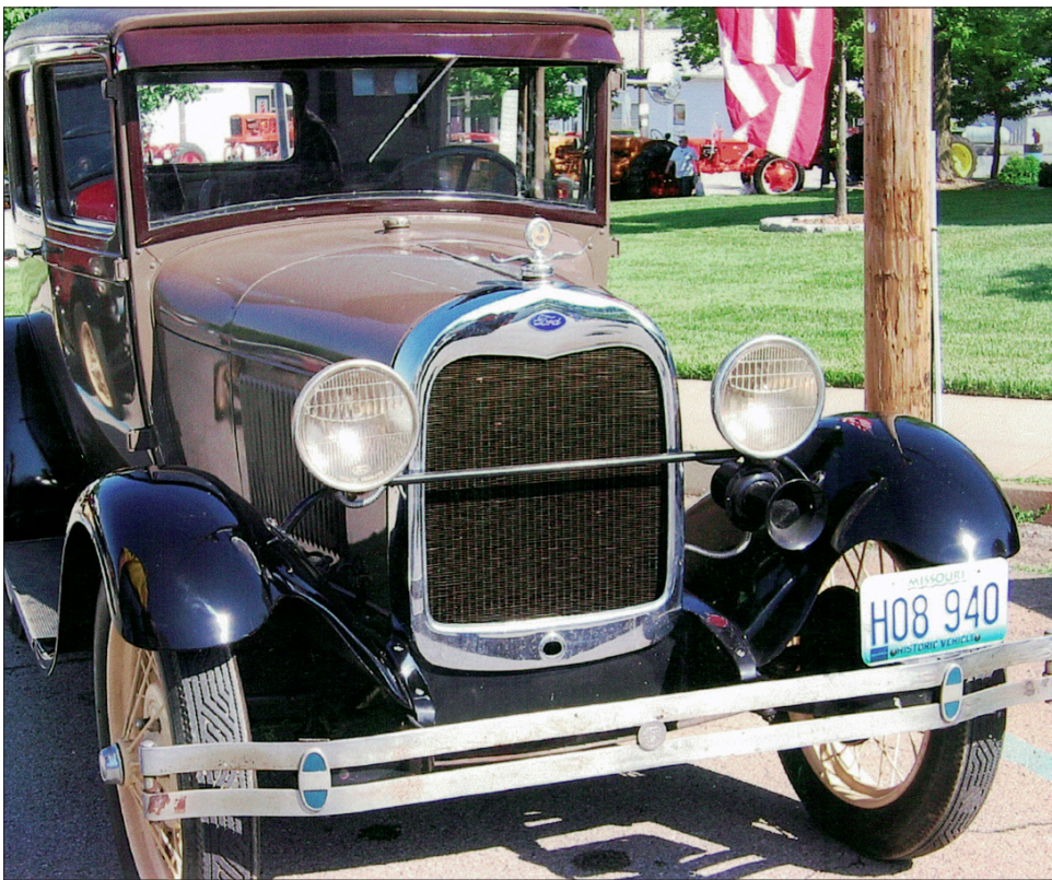
THIS 1929 Model A Ford was another of the cars purchased in the Cuba area. It was one of the cars used to reenact a Bonnie and Clyde car chase for the enjoyment of the spectators at the Ozark Extravaganza.

CALL 573-437-2323 today and ask how you can subscribe to the Gasconade County Republican for only 55¢ per week.